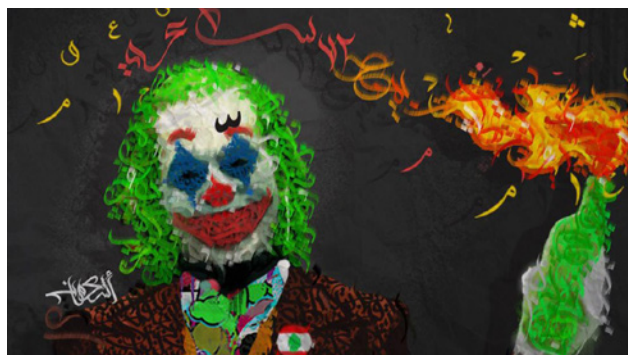
Fig. 12 - Street art during a protest in Beirut, Lebanon.

Moreover, using an internationally known pop culture character like the Joker as a symbol for the anti-status quo protests becomes a powerful way to attract attention from audiences across the world. For example, take the authors of this paper; we both consume and actively follow the Joker’s representation in cinema, but the film’s affect on the international audience invited us to work on this paper together. By wearing the Joker mask, protestors embraced the populist ideology of the film and stimulated a global discourse. Nevertheless, a contradiction seems to arise when looking closer at the dynamics of the new racism used within the film, as Arthur, opposite to most of the protestors around the world, has a racial characteristic that distinguishes him from the rest: he is white.